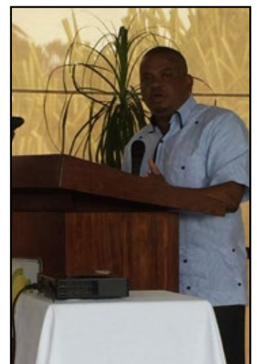
Hon. Patrick Faber, Minister of Education, Youth, & Sports