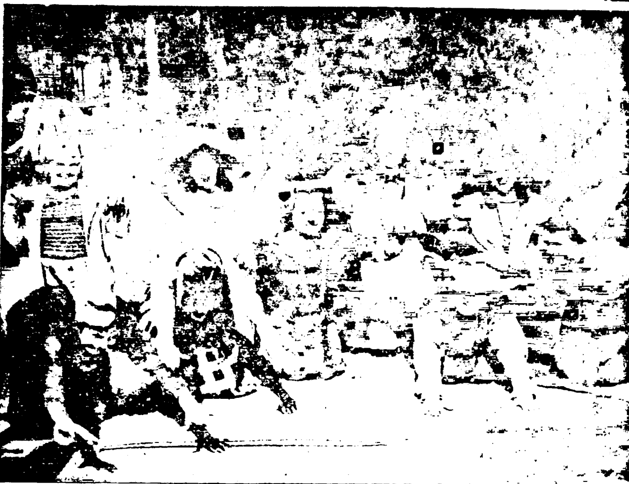
WELL FRESHMEN — Know what these strange creatures are? They're RATS!!! Yessir, and you won't look unlike them come Friday, November 19! Be prepared — Rat Day's fast a'coming!

Wednesday, November 24—Bye Bye for the Holidays.