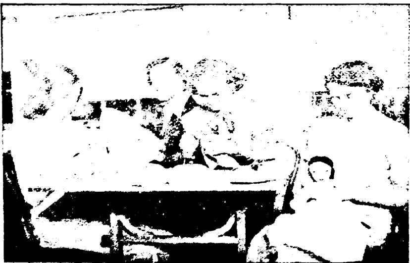
Painted wastebaskets, hand-painted towels and luncheon sets, rag dolls and lettered stationery are turned out by these Fine Arts Club members for their annual Bazaar.