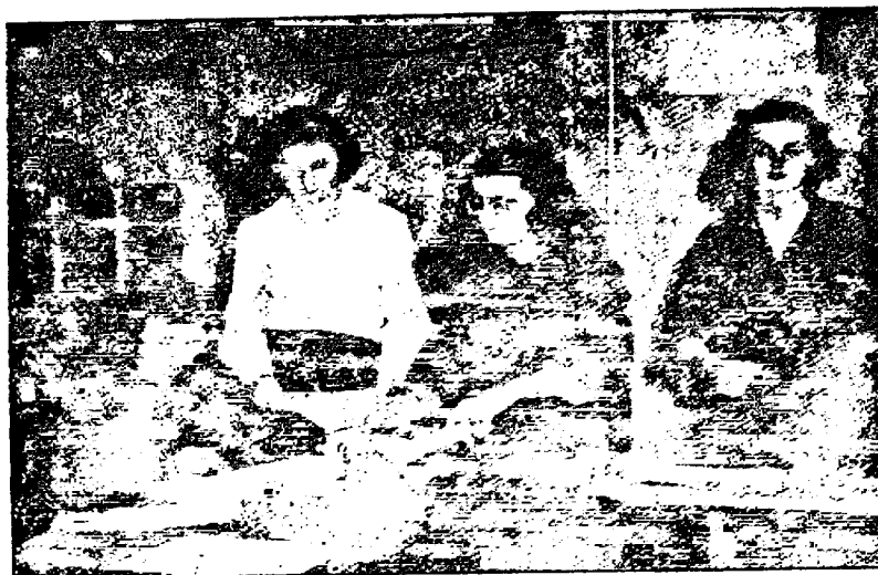
The above picture shows Fine Arts Club members at their last meeting, turning out finished products for their Bazaar, to be held December 3-4.

GIBSON PAGE CO., INC. Dealers in War Surplus Box 1130, Rochester 2, N. Y.