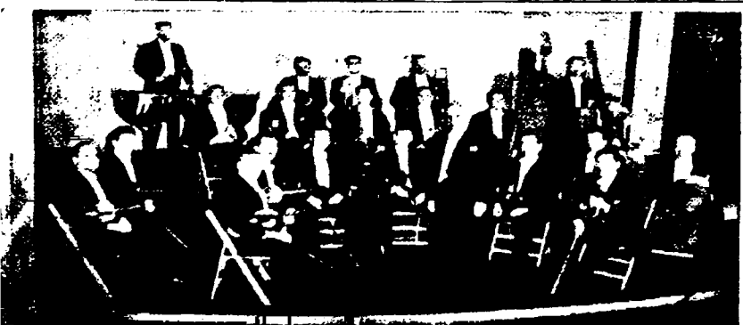
Philadelphia Little Symphony which performed on Thursday night.

November 7 — Valdosta Club, Sports practice, Dance Club, Student Council, Y Cabinet.