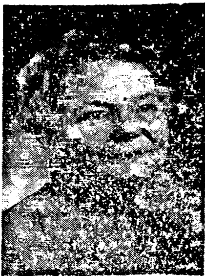
DEAN OF WOMEN