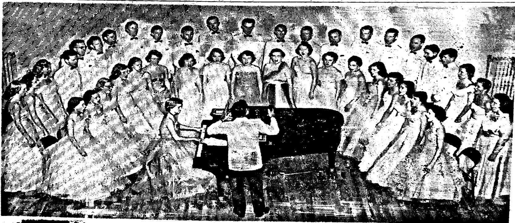
VALDOSTA STATE COLLEGE GLEE CLUB