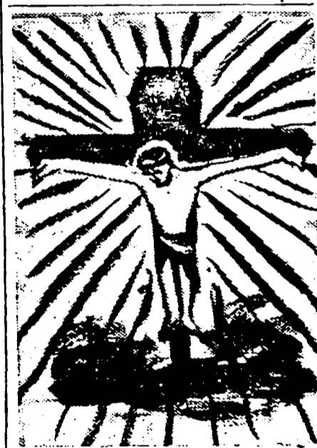
EASTER IS UPON US. APPROACH IT WITH REVERENCE