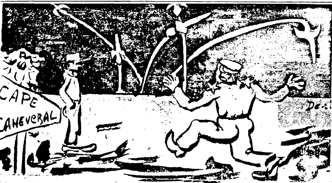
"I DON'T CARE IF IT IS THE FOURTH OF JULY, STOP FIRING THOSE ROCKETS!"