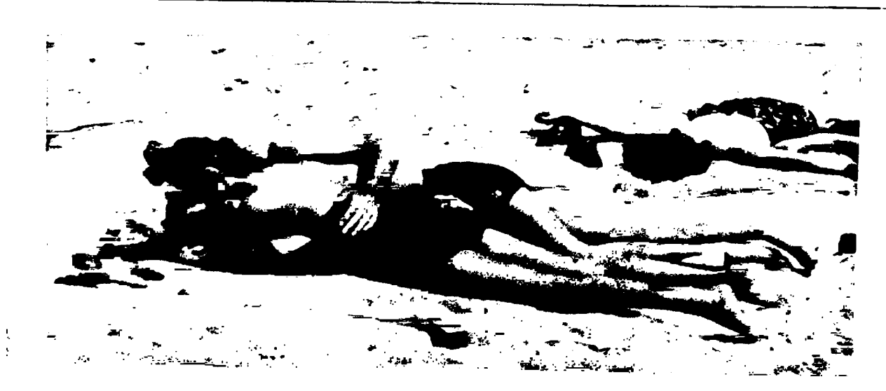
CANDID CAMPUS - "Where's the chaperones?" "They're gone, kiss me again."

The KD's are sponsoring their annual Slave Day on May 26 during activity period in the gymnasium. The three fraternities on