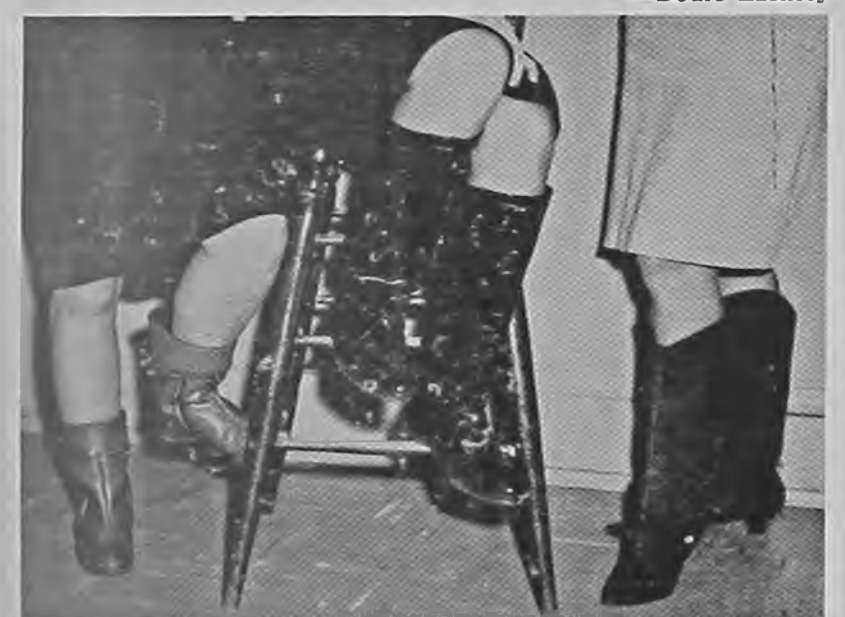
The new foot fashions are bootin' their way into the VSC