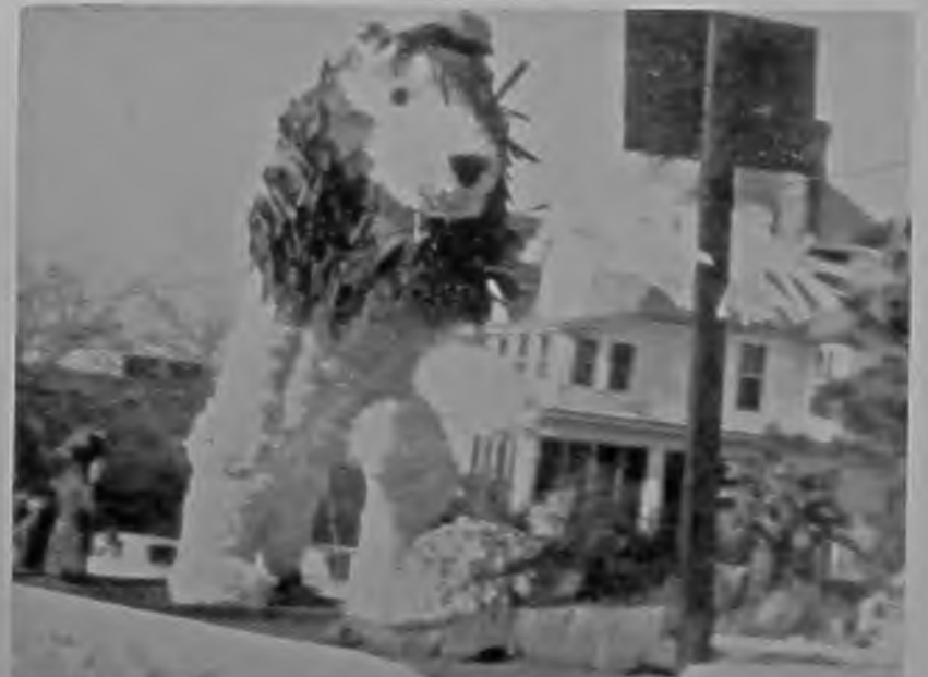
Most Appropriate: The MGM Lion roared for Tau Kappa Epsilon Fraternity.