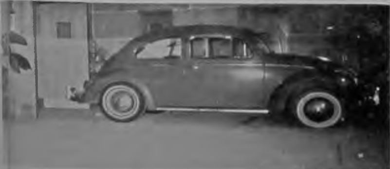
This quick-thinking Volkswagen found a way to beat the parking problem—it just drove into the dining hall.

Beginning this June, Fellows will serve a three-months' internship with a government agency in Alabama, Kentucky, or Tennessee such as the TVA, the Marshall Space Flight Center, a city or a department of one of the State Governments. During the 1965-66 academic year, they will take graduate courses in Public Administration at the Universities of Alabama, Kentucky, and Tennessee.