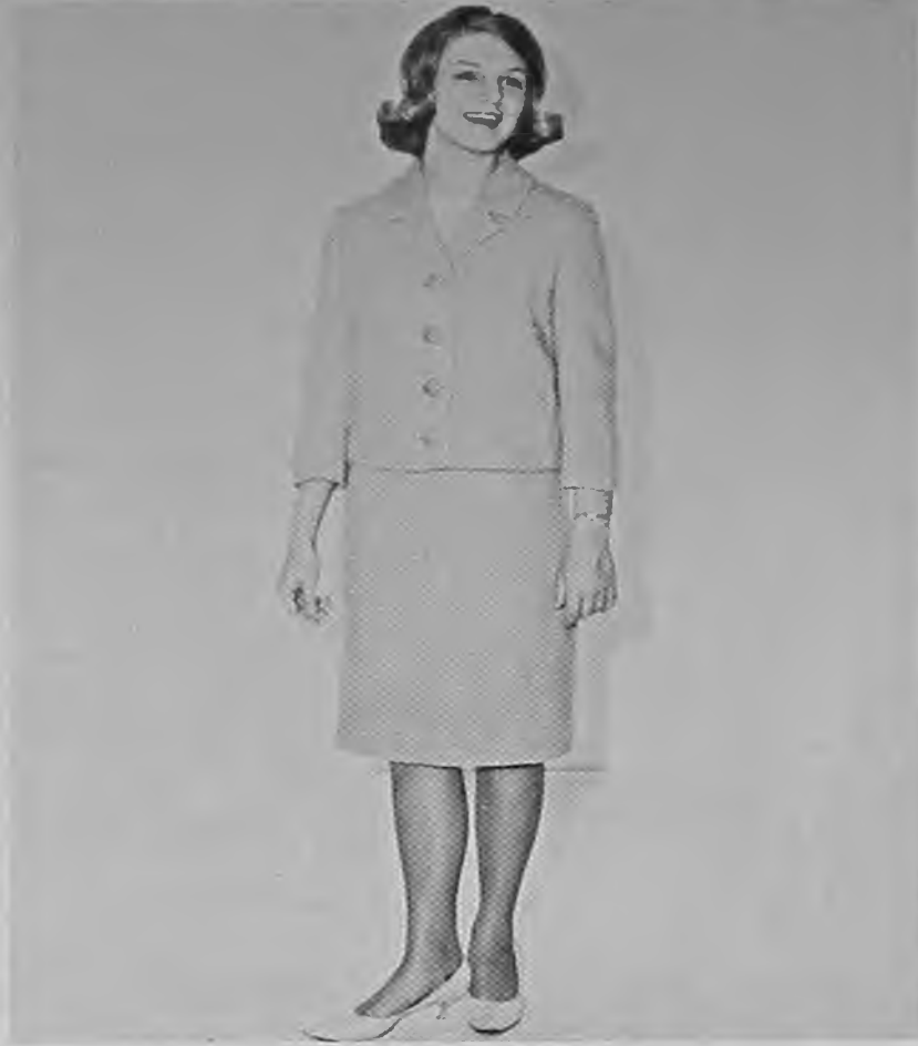
VSC's Best Dressed Co-ed