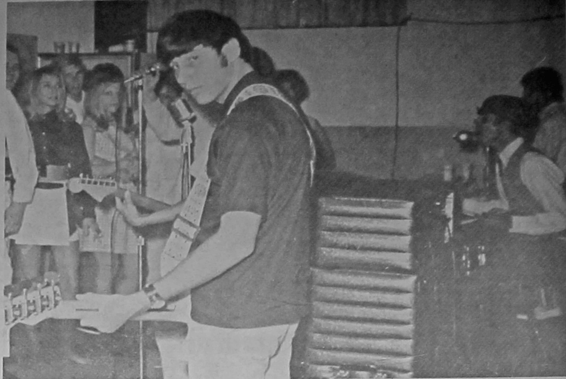
Lords of London