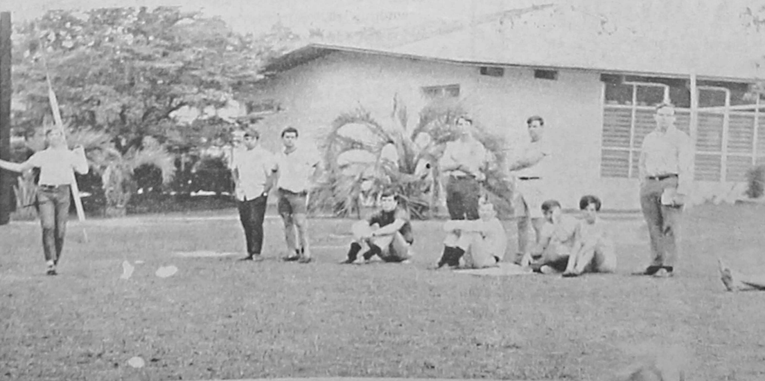
Horseshoe Champion Contenders

A first in Union Board history--students play general games at 11:00 after Student Union officially closes.